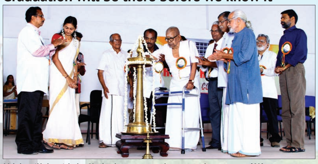
Mahakavi Akkitham Achuthan Namboodiri inaugurating the course comletion ceremony 2013

"In this best of possible world all is for the best" -VOLTAIRE (1694 -1778)