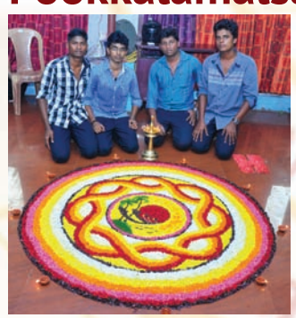
SIMAT team in Appollo Gold pookkalam

The S4 students of Civil Department of Sreepathy