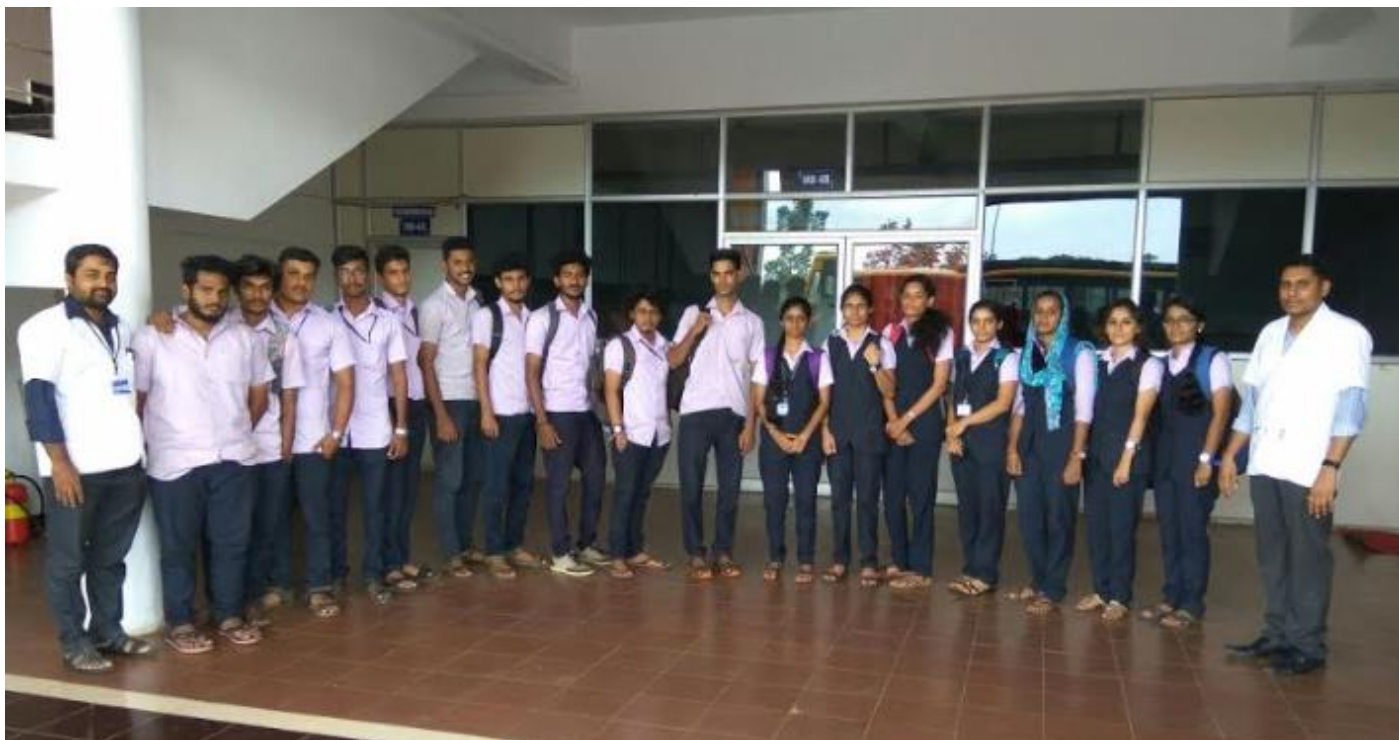
Participants of Android Application Development Workshop