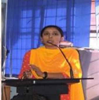
From felicitation speech