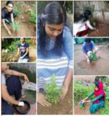
വരും തലമുറയ്ക്കായി ഈ തൈ ഞാൻ സംരക്ഷിക്കും

pollution, human overpopulation, and global warming, to sustainable consumption and wildlife crime.