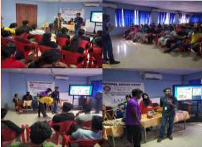
From Adventure session

The second day of the camp started at 5.30 am with morning drill & exercises, followed by assembly at 7 am.