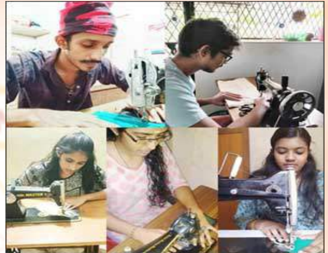
NSS Volunteers making masks

COVID-19 has changed all our lives in the recent weeks. While a vaccine is still far away we can only protect ourselves by social distancing and by using face masks and other protective shields. During this pandemic period face mask has become a part of our daily lives. The NSS Unit 233 of SIMAT along with the staff of Sreepathy have taken an initiative in making masks for the needy people and students of nearby schools and also for our college.