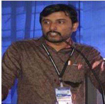
From welcome speech

The NSS Unit 233 of Sreepathy Institute of Management and Technology conducted a self-organized Adventure Camp for the first time in the history of Sreepathy as well as among the other NSS Units in Kerala. The 3-day Adventure camp - TAKSHILA was from Feb 21 st -23 rd , 2020 at Sreepathy. The camp was comprised