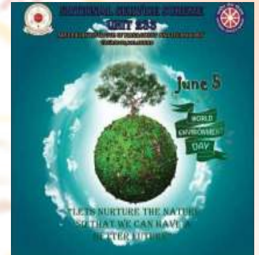
Poster by NSS Team

and in the gardens of each volunteers to nurture the future. Even during this Pandemic period our staff and volunteers actively took part in this small step towards protecting our nature for future generations.