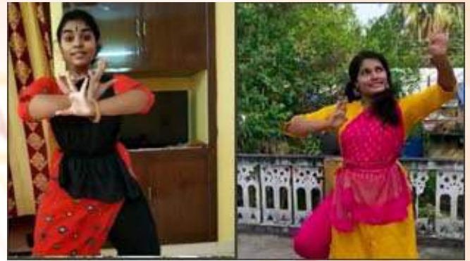
From the online Dance Competition

International Dance Day is a global celebration of dance, created by the Dance Committee of the International Theatre Institute (ITI), the main partner for the performing arts of UNESCO. The event takes place every year on 29 April, which is the anniversary of the birth of Jean-Georges Noverre (1727–1810), the creator of