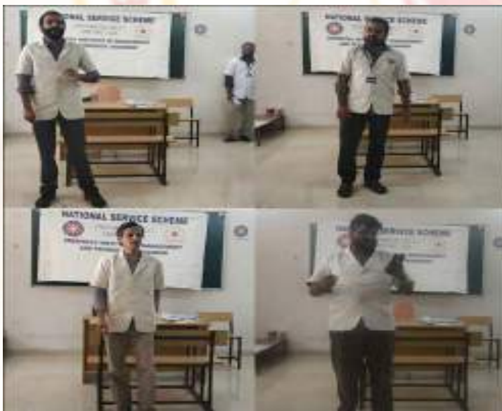
From kavitha parayanam

February 21 is celebrated as the International Mother Language Day worldwide, as declared by the United Nations in 2000. The annual observance is marked to promote awareness of linguistic and cultural diversity and promote multilingualism.