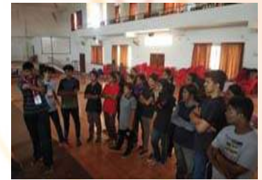
From Adventure session