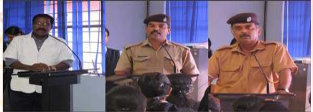
From the inaugural ceremony

On 14 th February 2020, as a part of Pulwama Day Observation, the NSS Unit observed the day by organizing a Honouring Program for the Ex-Military Servicemen (Security guards of Sreepathy). The