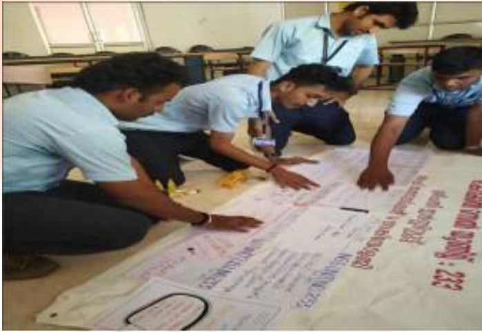
Poster making by NSS Volunteers

The NSS Unit of SIMAT observed the National road and safety week by providing a lot of helpful and necessary information to the students of Sreepathy Institute of Management and