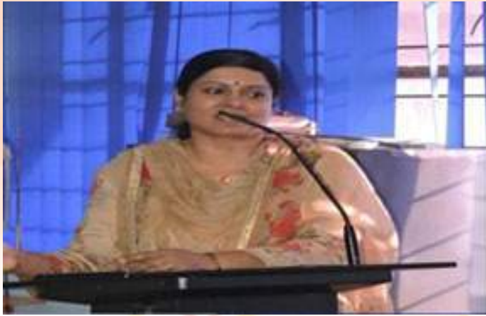
From Inaugural Ceremony

The NSS Unit 233 of Sreepathy Institute of Management and Technology conducted a self-organized Adventure Camp for the first time in the history of Sreepathy as well as among the other NSS Units in Kerala. The 3-day Adventure camp - TAKSHILA was from Feb 21 st -23 rd , 2020 at Sreepathy. The camp was comprised