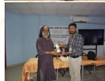
From Onnayi Munneram