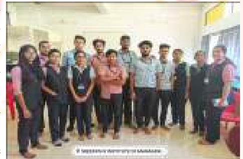
Motor Automation Workshop participants

A motor automation workshop was conducted as a part of fund raising program for the SB in relation with the Tech Fest. This workshop witnessed the presence of 11 participants including the execom members and IEEE SIMAT SB Volunteers. This workshop marked the beginning of a series of workshops which aims at producing a product which can be marketed. The basics of an automatic water level controller that turns off the motor when the water rises beyond a level was taught. The participants were imparted with basic concepts circuit, connection and components used in the product.