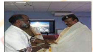
Honouring the Ex-Service men