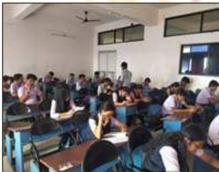
From technical quiz

IEEE SIMAT SB had conducted a Technical quiz as a part of our college tech-fest panchajanya 2020. The quiz witnessed vibrant participation of students who were ready to compete with each other on science and related topics. On a total 45 students participated among which the top 5 students were selected. The questions were based on science, inventions and about IEEE the largest organisation of scientist