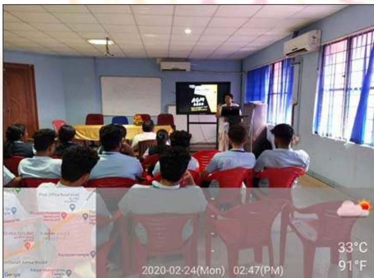
From the AG Meeting