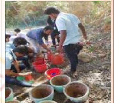
Flower pot painting

As a part of campus beautification work, the NSS volunteers of Sreepathy conducted campus cleaning and flower pot painting on 25 th January 2020.