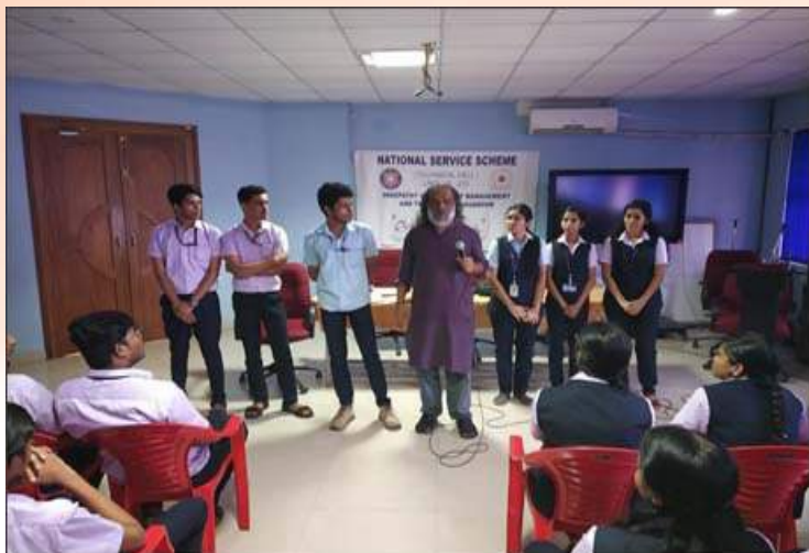
From Group activities

On 15th January the NSS Unit 233 of SIMAT organized a motivational and group dynamics session for the first year students of SIMAT.