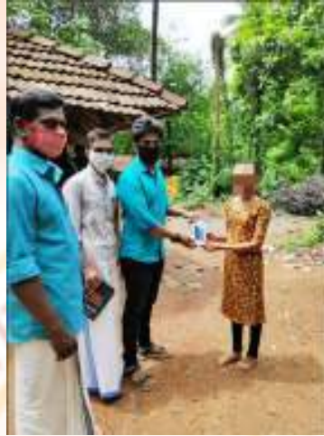
Handing over smart phone

COVID-19 pandemic brought sudden changes to the society especially education system of Kerala. The classroom teaching system has been completely changed to Online teaching procedures. Classes through television and mobile phones have come into effect. Classrooms were replaced by online platforms like Google Meet, Zoom etc.