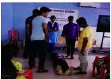
Disaster Management Session

The 3 day camp ended with the feedback session followed by the Prize distribution session & closing ceremony.