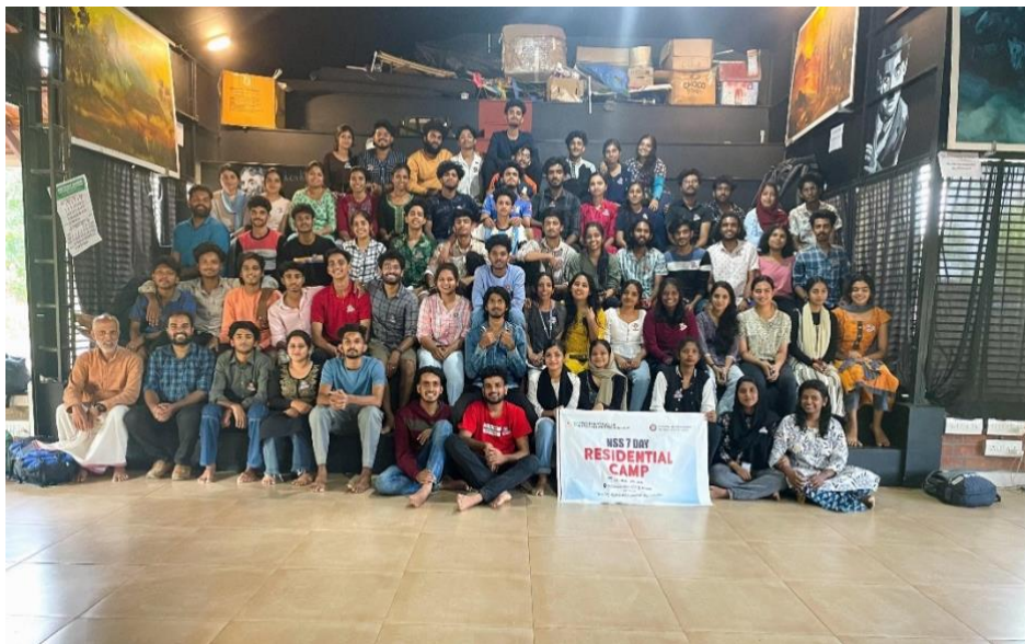
Poster and snaps from the program