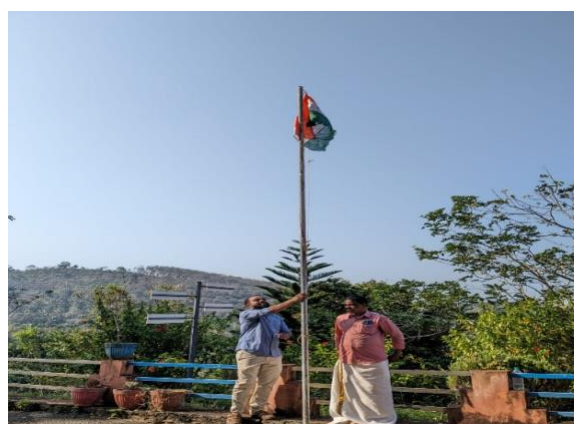
Poster and snaps from the program

NSS UNIT 233, SIMAT also observed these days