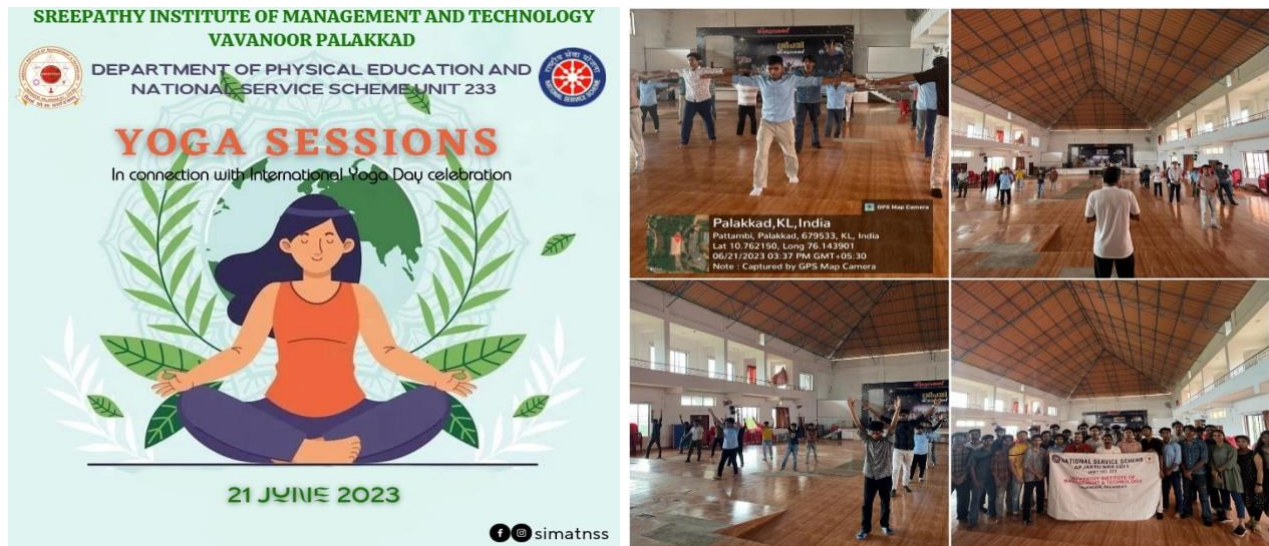
Poster and snaps from the program

with the presentation, the P.T sir also made the students perform few yoga asanaas. With the help of seniors, the students were able to perform the asanaas. It was one of the important sessions for all of us as it helped us know the importance of yoga in our daily life. The program was successful and it was completed at 4 P.M.