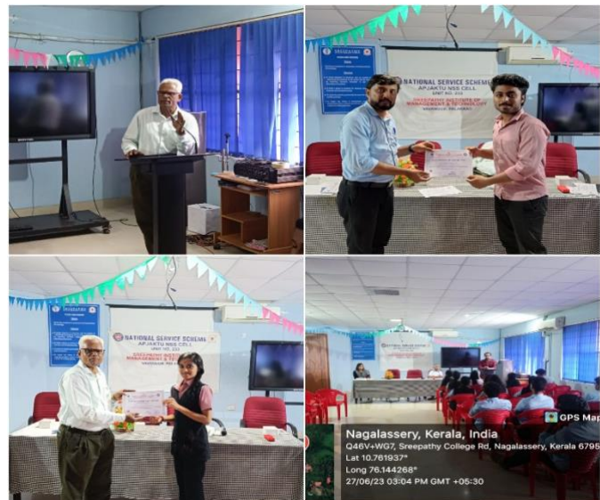
Posters and snaps from the program

NSS UNIT 233 SIMAT also observed these days