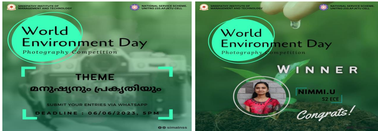
Poster and winner of the competition

As a part World Environment Day, volunteers of NSS UNIT 233 SIMAT organized a photography competition to celebrate the intricate relationship between humans and nature. The competition aimed to raise awareness about environmental conservation and encourage participants to explore and capture the essence of the bond between humans and nature through photographs. Many of the students participated in the contest and submitted their entries before the deadline. The winner of the competition was Nimmi. U ( S2, ECE).