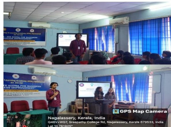
Posters and snaps from the program