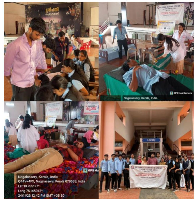
Posters and snaps from the program