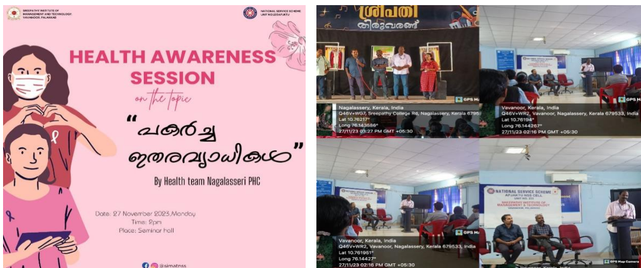
Posters and snaps from the program

Volunteers of NSS unit 233 ,SIMAT conducted a awareness session of 'HEALTH AWARENESS SESSION' on 27th November 2pm to 4pm.The session handled by medical officers( Nagalasseri ,PHC).The session was about spread of contagious diseases and the changes we have to make in our lifestyle to be healthy. Later on they presented an entertaining and informative drama about the influence of fast food and how it affect our physical health.The session windup with vote of thanks .